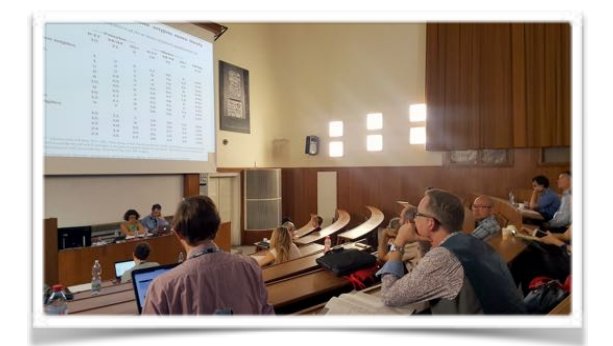
SG Section, ECPR Prague 2016