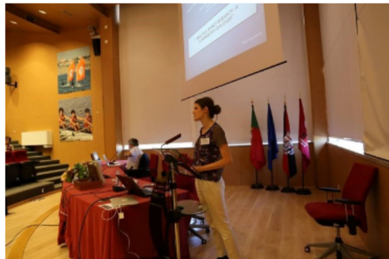
Giving a tutorial on practice based and problem solving research