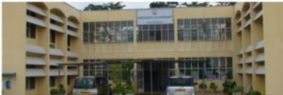
University of Burundi.