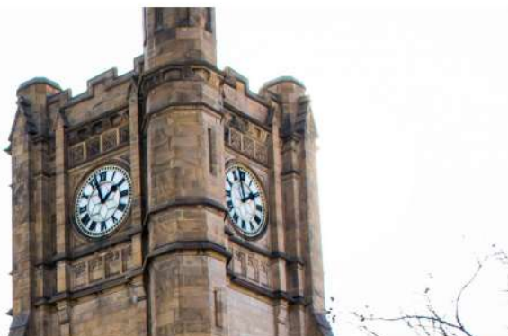
Photo of the University of Melbourne