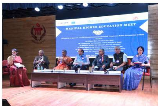
Manipal Higher Education Meet in 2018