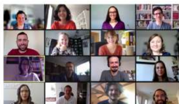
Virtual workshop participants