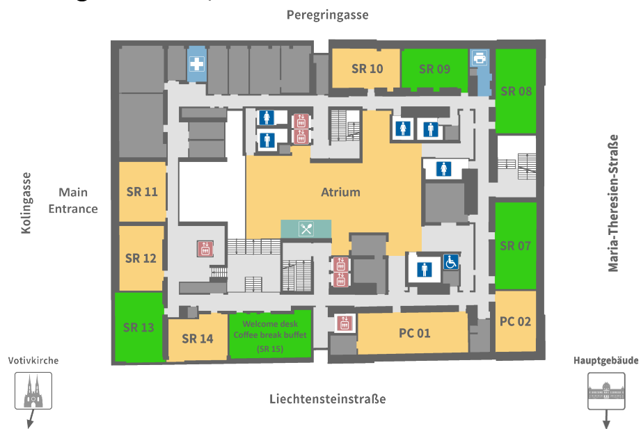
Figure 1: Floor plan Conference