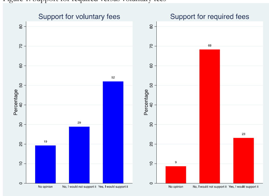
Figure 1. Support for required versus voluntary fees

The much higher support for a voluntary fee is consistent across the various sectors of the SG members according to their self-described academic position (Table 1). A plurality of the respondents in all categories support the introduction of a voluntary fee, whereas a majority of all groups reject a required fee and the size of that majority increases with the precariousness of the academic position of the respondents.